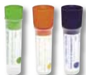
A2001 A2001 A2401